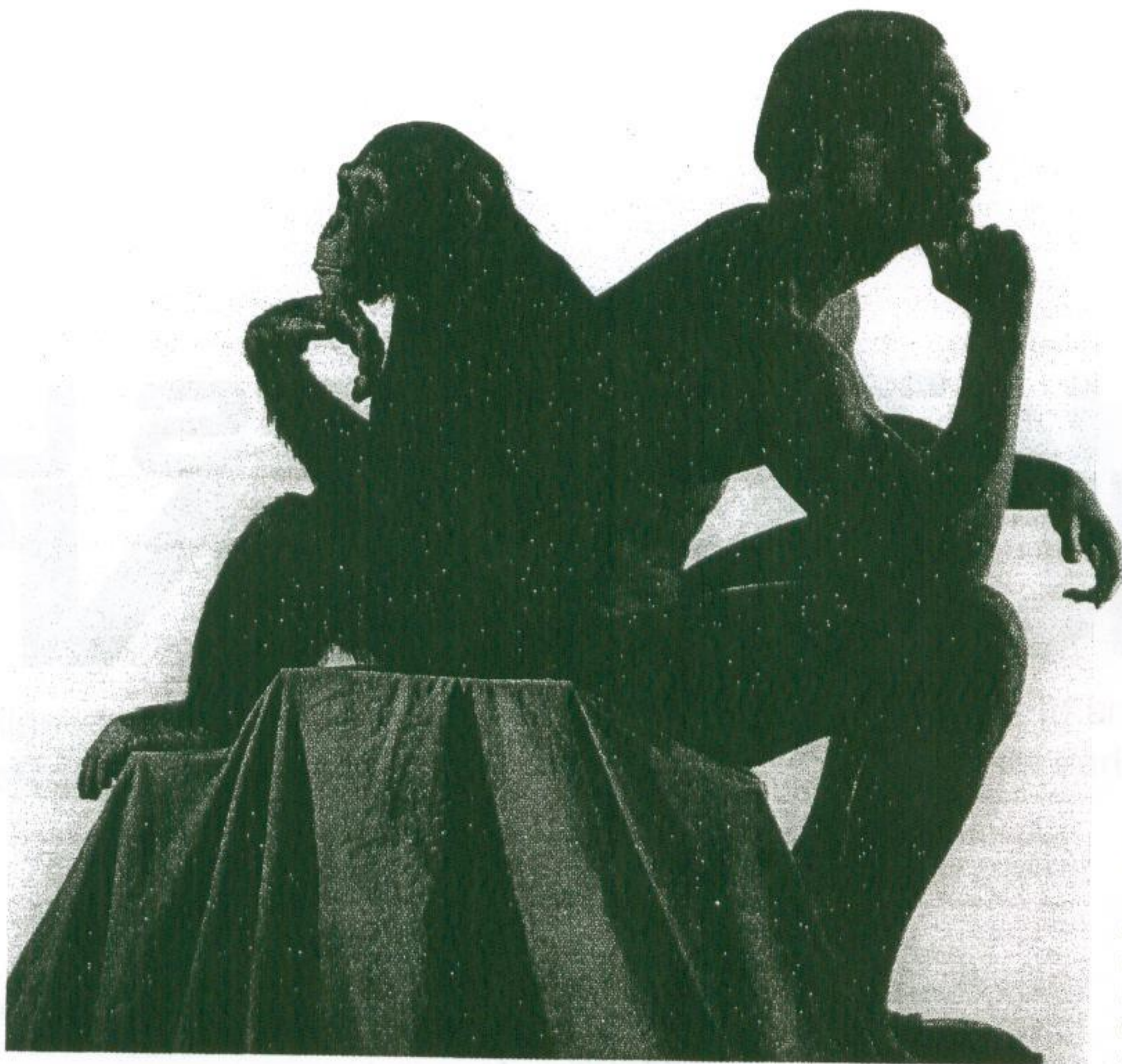
THE 1 PERCENT DIFFERENCE: Humans are distinct from chimpanzees in a number of important respects, despite sharing nearly 99 percent of their DNA. New analyses are revealing which parts of the genome set our species apart.

human genome with information from public databases, I zoomed in on HAR1. The browser showed the HAR1 sequences of a human, chimp, mouse, rat and chicken—all of the vertebrate species whose genomes had been decoded by then. It also revealed that previous large-scale screening experiments had detected HAR1 activity in two samples of human brain cells, although no scientist had named or studied the sequence yet. We yelled, “Awesome!” in unison when we saw that HAR1 might be part of a gene new to science that is active in the brain.